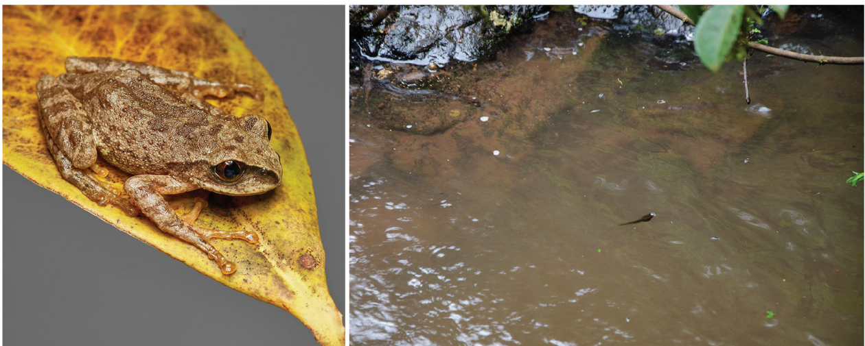
Figure 1. Adult L. ragazzii (left), brown phase, captured in grass about 30 cm from the stream where we discovered swimming larvae (right).

The illustrations (Figs 2, 3) were performed in Adobe Illustrator by one of the authors (AT) from one of the voucher specimens (ZSM 286/2018), soon after its preservation. The mouthparts of L. gramineus shown in Fig. 3 were depicted from the specimens of a parapatric population from Bale Mountains high plateau (ZSM 18/2917 and 19/2017).