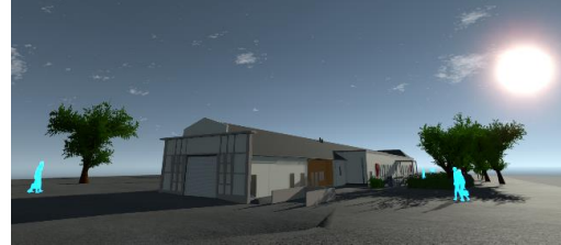
Figure 2: Nursery in VR.

the visibility of the objects. In this study case, we apply a binary choice: when walking outdoor, indoor objects are hidden, to consume less resources and when walking indoor, everything is loaded: in one future work we could show only the rooms close to the current one. About lights, as the building project is on built phase, major modifications are not possible. But at least users want to check the exposure depending on the sun, the interior lights and the walls/windows materials. For this issue we had to get back the building orientation from Revit to Unity. Then we use the Revit solar cycle simulation to get the positions of the sun path, depending on the date of the year. In Unity, we simulate three different solar cycles (equinox, summer and winter solstice). So we allow end users to check the building exposure in the VR system and to ensure quality to the user experience, users can stop at any moment the solar cycle and stay with the current exposure.