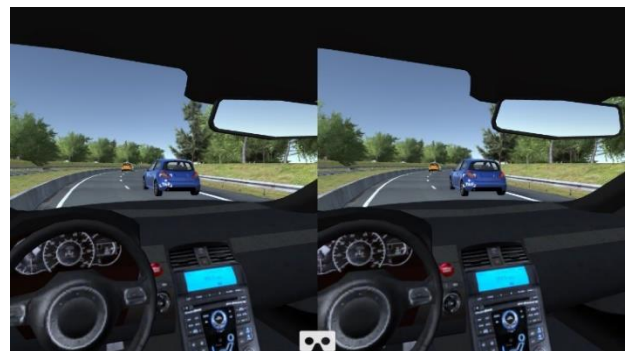
Figure 2 - Screenshot of the first version of 3DAV explore in virtual reality mode