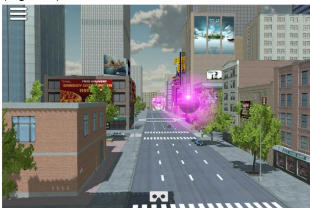
Figure 5 - Outside view of vehicle and pink dots

Two different modes of transportation are available to the user in this second application. By default, the user is placed outside of any vehicle, flying above the road. In this mode, he can move around the city by targeting the pink dots scattered all around the scene (Figure 5).