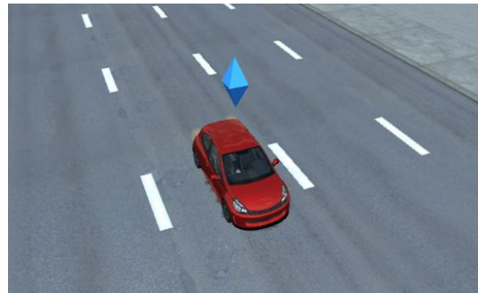
Figure 6 - Vehicle currently under user's control

In order to enter the second mode the user must target one of the red cars and tap the screen. He will then be transported to the driver seat of said car and takes control of it. A blue diamond above the vehicle signals to other users that the car is already being used and can't be entered (Figure 6).