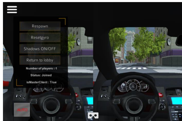
Figure 7 – Menu options

In both modes a button on the bottom of the screen allows to switch between 2D and 3D view to be used in a VR headset. While in 3D mode, the vehicle is controlled by the head's movements. Leaning forward and backward will accelerate and decelerate respectively and left/right movements will allow to turn the wheel and look around.