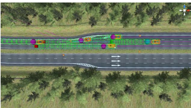
Figure 9 - ITS Traffic component in action in the first version of 3DAV explore

The traffic component also offers a simple car spawning component, which handles car addition during the simulation in real-time. It was configured to spawn cars in a 250 meters radius from the main point of interest of the scene: the lane merging point (see Figure 9).