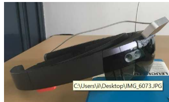
Figure 1. LMC attached on the top of HoloLens

In this work, we first investigated how to combine the two devices to get them working together in real time, and then we evaluated the proposed 3D hand interactions.