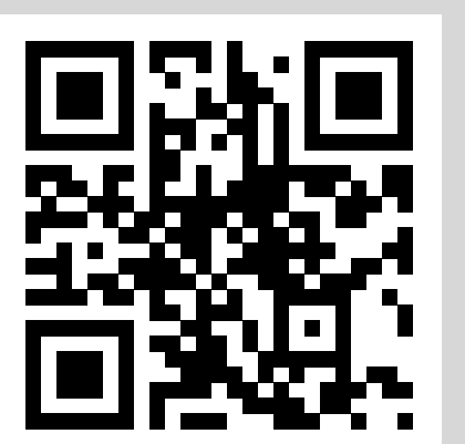
BiDes: l'altra cara del silenci [ BiDes: the other side of silence ]