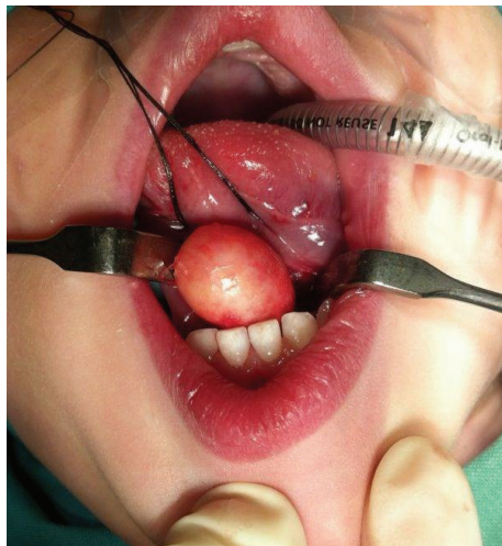
FIGURE 3: Surgical excision of the lesion.