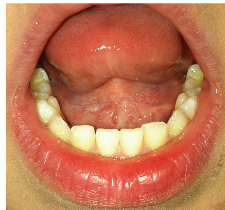
FIGURE 5: Clinical appearance 6 months after the excision.

a precise indicator of malignancy. The lymphatic malformations and lymphohemangioma are considered to be 25% of all benign tumours that affect children; however their location is more typical in the axillary region and head and neck, with the dorsum of the tongue as the main intraoral site. Also, these types of tumours are often present in 65–75% of cases at the time of birth [15].