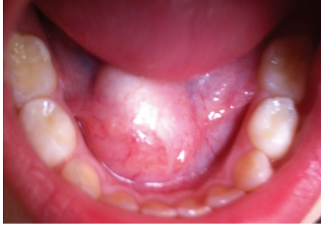
FIGURE 1: Preoperative photograph of the sublingual mass. An asymptomatic mass can be seen which protrudes discreetly onto the floor of the mouth.

They are commonly observed during the 2nd and 3rd decades of life [1, 2, 4, 5] and are rare in children [3, 7], although there is a case described in a newborn [11]. The hormonal stimulation during puberty, along with hypersecretion of fatty tissue, could explain the increased incidence in this age group [9].