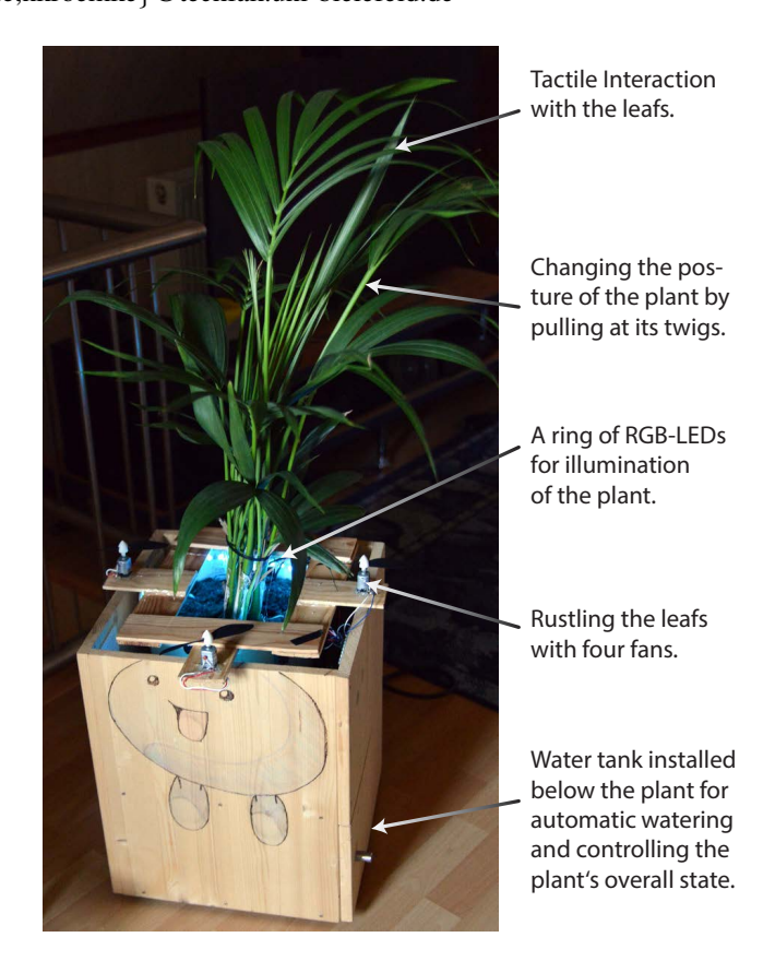
Fig. 1. Prototype of the InfoPlant, installed in a living environment.

When thinking about possible entities with these qualities, several objects might come to mind, which are in some way important to the respective person. However, we think that few are as universally appreciated as plants are: Being part of our natural environment, they can be found almost everywhere, including in our homes and our offices. Furthermore, plants already have their own way of communicating to us some aspects of their overall state: Most of the time it's easy to tell if a plant needs more water, and for many plants we can see them turning towards a specific direction due to phototropism [4]. Finally, most people intuitively have a generally positive attitude towards plants, and, as "primal" natural entities in our surroundings, they are able to elicit feelings of connectedness and care, as has been hinted at in a recent study [5].