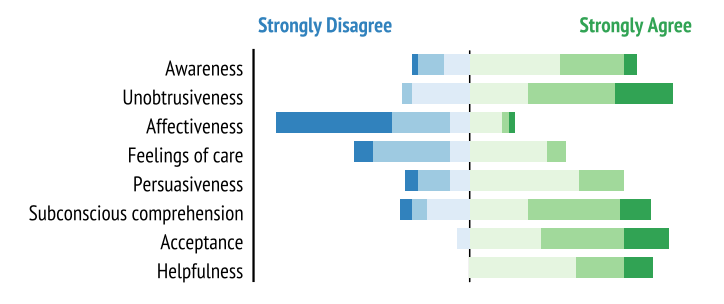
Fig. 4. Condensed results of the questionnaire. Each item corresponds to a number of underlying questions. The answers were given on a 7-point Likert-type scale. Displayed are only the responses that were not "neutral".

In order to keep the different runs comparable and reproducible, instead of manually changing consumption values for the InfoPlant to react to these changes, we scripted a simulated consumption-scenario, which was executed for each trial. After an explanation of how the InfoPlant is displaying the