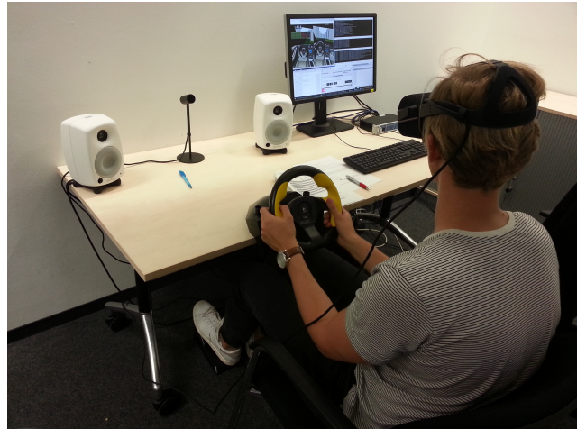
Figure 2: Hardware setup for the study. Two additional loudspeakers (not seen in the picture) were placed behind the participant. The computer monitor on the right was used only for controlling the application and could not be observed by the participants during the experiment. The head tracking sensor of the Oculus Rift can be seen between the two loudspeakers in the front.

scratch in three.js 3 (i.e. it can be run in any browser), which makes the system a very portable one 4 .