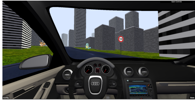
Figure 1: Picture of the car simulator.

Analogous representations, in contrast, keep users informed at all times, provide an, in most cases less accurate, yet continuous cue about the underlying condition and leave the decision making in the hands of the user/driver. The reason why continuous auditory displays (or sonifications) have not yet been considered for the speedometer is that a continuous sound would most likely be rather annoying in itself (even if we readily accept permanent engine sounds and would even object if they were removed). One might also argue that we already have such a (physical) auditory speedometer in form of the rolling sounds of the wheels. These, however, are not gauged and depend on the street surface. Furthermore, they are masked by other sounds like the car's audio system and the sound of the engine and don't provide information relative to the context, i.e. the prevailing speed limits.