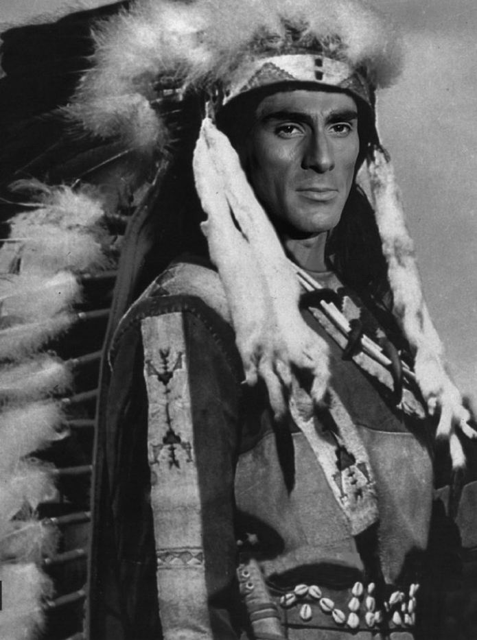
LEFT: FILM STILL FROM "DIE SOHNE DER GROSSEN BARIN" ("THE SONS OF GREAT MOTHER BEAR"), 1965, DIRECTED BY JOSEPH WACH. BELOW: KOFF REAL INDIAN CORN BEER, FINLAND. LOGO: COLORADO BAR AND GRILL, HELSINKI, FINLAND.