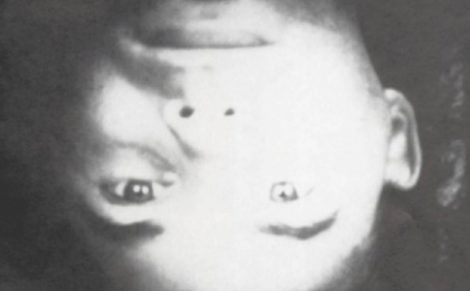
David Askevold It's No Use Copying (1972)