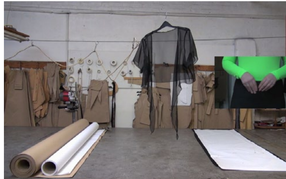
Lucy Clout Shrugging Offing (2013)