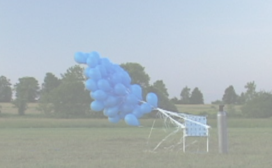
Laurel Woodcock Conditions (2006)