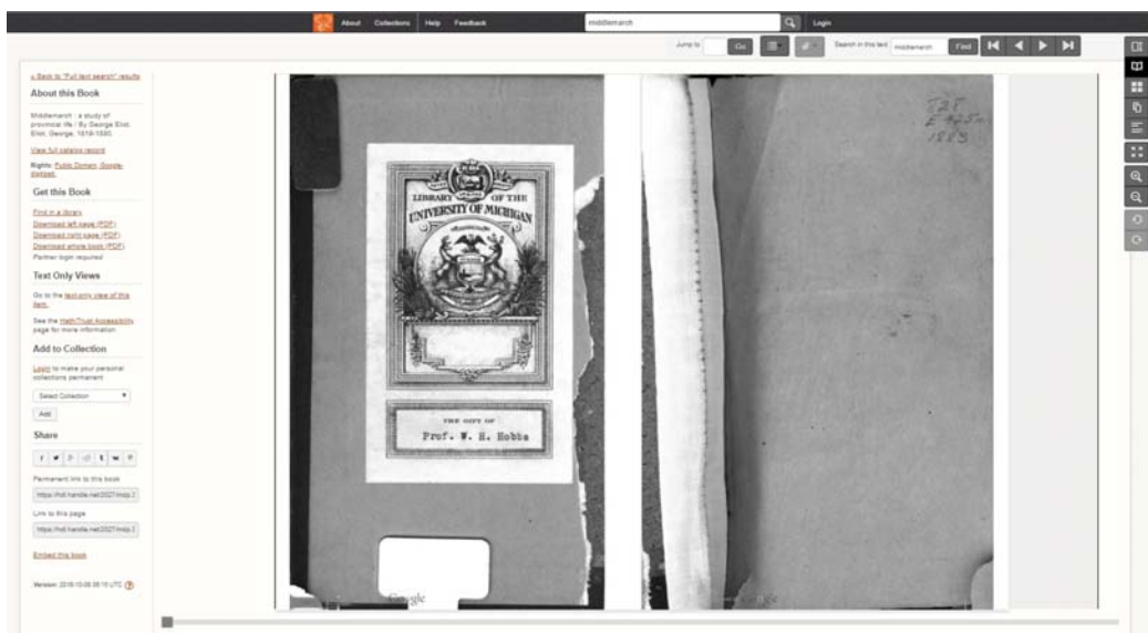
Figure 2. Middlemarch as housed in the Hathi Trust