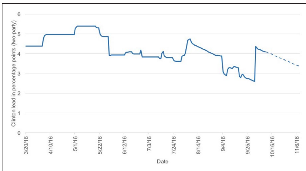
Figure 2. Clinton's predicted lead by the Issues and Leaders model.

trend (shown in Figure 1) for both the model intercept and variable coefficients. The rationale behind this is to be conservative and to acknowledge uncertainty when making predictions, for example, due to estimation or measurement error (Armstrong et al., 2015). For instance, comparing issue and leader scores across elections is difficult since both the availability of polling data as well as the timing of key events varies across elections.