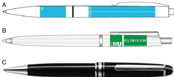
Figure 1 The three ballpoint pens involved in the study: Schneider's K15 (A), Ritter PEN 01711 Classic (B) and Montblanc Masterpiece Platinum Line Classique (C).