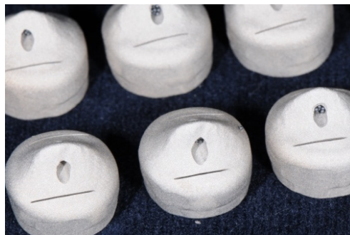
Figure 3. Cobalt-chromium secondary crowns with a hole for the pull-off test directly after sintering.

For the fabrication of the CoCr secondary crowns, each primary crown was scanned (Arti-Spray, white, BK 285, Dr. Jean Bausch; Ceramill map 300, AmannGirrbach) and secondary crowns were designed with a hole for the pull-off test. Then, 30 CoCr crowns were milled of blanks with Ceramill Motion 2 (AmannGirrbach) and the appropriate milling tool (Ceramill Roto Motion 0.6 LOT 20120315; 1.0 LOT 20120605; 2.5 LOT 2010605, AmannGirrbach). For the sintering process, the specimens were set in a sintering furnace (Ceramill Argotherm, AmannGirrbach) at 1 bar pressure of argon and 1.2 bar compressed air, according to the manufacturer's instruction. The sintered CoCr crowns (Figure 3) were air-abraded using alumina with a mean particle size of 110 µm at 2 bar for 10 s (basic Quattro IS, Renfert, Hilzingen, Germany; Korox 110, LOT 14878430513, Bego, Bremen, Germany). After adaptation on the primary crowns with cross cut burs (Komet Dental, LOT 277889), each secondary crown was polished the same way for 3 min to a high gloss (Abraso-Starglanz asg, REF 52000163, bredent) in order to standardize the technical baseline situation, which might influence the retention force.