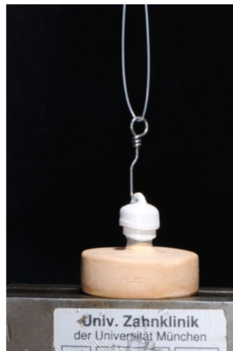
Figure 6. Experimental setup for the pull-off test: a hook pulls a zirconia secondary crown off a PEEK primary crown.