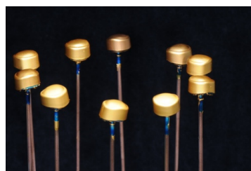
Figure 5. Primary crowns with gold copings on rods after the electroforming process.