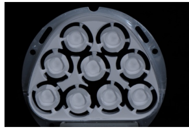
Figure 4. Zirconia blank with milled secondary crowns of 0^\circ taper angle.