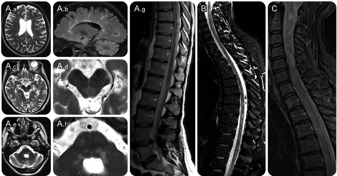
(A) Patient 2: cerebral MRI showing typical MS deep white matter lesions (A.a, T2w, axial plane) and partially confluent callosal lesions (A.b, FLAIR, sagittal plane). Furthermore, bilateral lesions in the periaqueductal gray (A.c, T2w, A.d: magnified view) and bilateral pontomedullary lesions were observed (A.e, T2w, A.f: magnified view). sMRI displaying LETM and segmental atrophy in the lower thoracic and lumbar spinal cord (A.g, level T8-T11). (B) Patient 1: sMRI showing multiple partially confluent lesions in the cervical cord from C1-C6 (FLAIR, sagittal) and in the thoracic cord with focal atrophy. (C) Patient 3: sMRI demonstrating LETM from C2-C5 (FLAIR, sagittal). FLAIR = fluid-attenuated inversion recovery; LETM = longitudinally extensive transverse myelitis; MS = multiple sclerosis; sMRI = spinal MRI; T2w = T2-weighted.

positive for serum anti-MOG IgG. These patients with MS had clinical features seen in patients with NMOSD, 19 namely, relapses with severe ON, myelitis, and/or brainstem syndrome. On spinal MRI, 4 of these 5 patients showed severe spinal cord involvement with multisegmental lesions as well as extensive cord atrophy including longitudinally extensive transverse myelitis in 2 patients. Otherwise, all 5 patients had typical MS lesions on cranial MRI, positive OCBs in the CSF, and a typical relapsing-remitting MS disease course. It has already been assumed that some patients with Abs to MOG represent a subgroup of optico-spinal MS, 24 a notion supported by our observation but also expanded by the fact that our patients had otherwise rather typical MS.