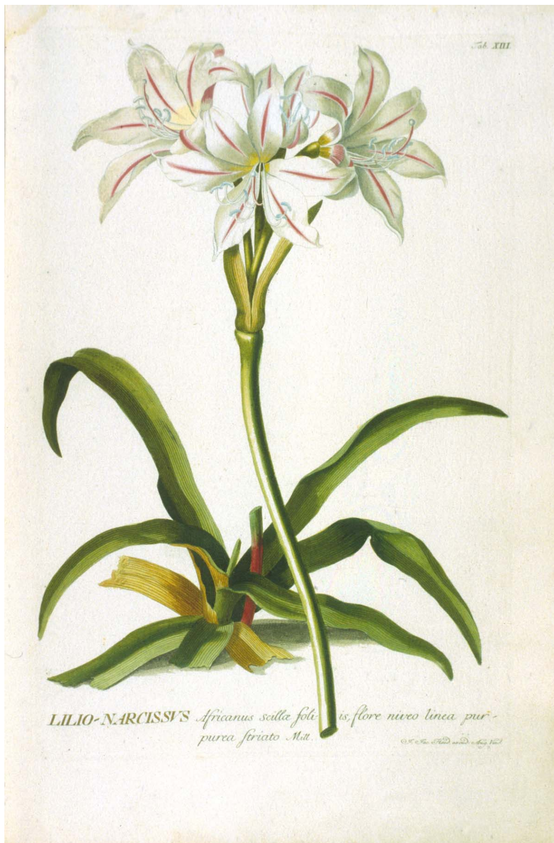
Figure 1: Lilio-Narcissus , from an original watercolour drawing by G. D. Ehret (Trew Plantae Selectae , Vol. 2, 1751).