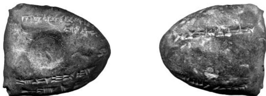
Fig. 20, a-b : 85-2-22, 40.