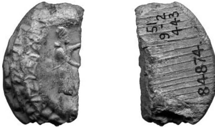
Fig. 5, a-b : BM 84874.