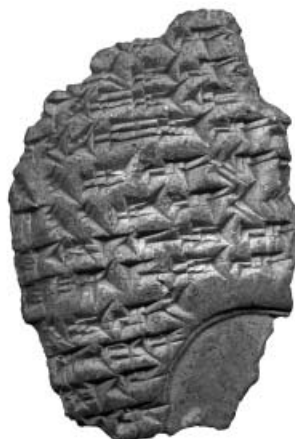
Fig. 22 : K 1483.