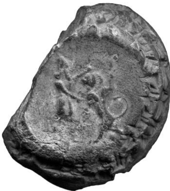
Fig. 4 : K 391.