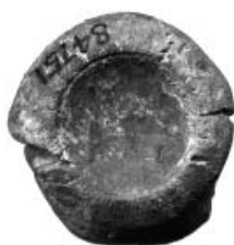
Fig. 18 : BM 84751.