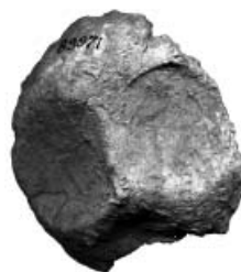
Fig. 29 : BM 89971.