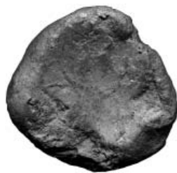
Fig. 26 : BM 84579.