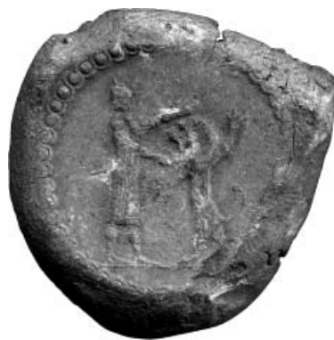
Fig. 3 : BM 84672.

The so called 'Assyrian royal seal type', showing the king stabbing a rearing lion with his sword (e.g., BM 84672; fig. 3 ), is by far the best known and also best attested bureau seal (Sachs 1953; Millard 1967; Millard 1978; Herbordt 1992 : 123-136; Maul 1995). Suzanne Herbordt (1992 : 124-127 11 ) was able to collect a minimum of 104 individual seals which were in use over a span of roughly two centuries, the earliest dated by the cuneiform label inscribed on the clay sealing to the reign of Shalmaneser III (858-824 BCE) 12 . The motif could also be used for a king's personal cylinder seal, as illustrated by the seal of Esarhaddon (680-669 BCE) which can be identified by its inscription and is known from a sealing from the Review Palace of Nimrud (CTN 3 26; Watanabe 1993 : 110-111 : no. 2.2).