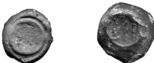
Fig. 14 : BM 84671.