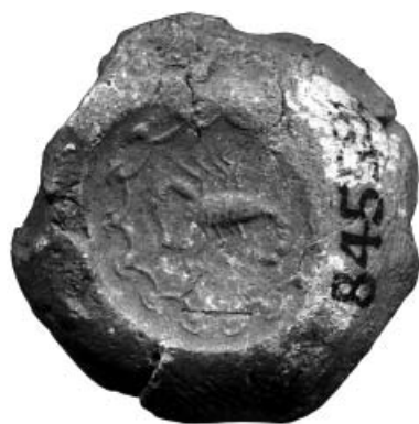
Fig. 6 : BM 84559.