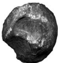
Fig. 28 : BM 89947.