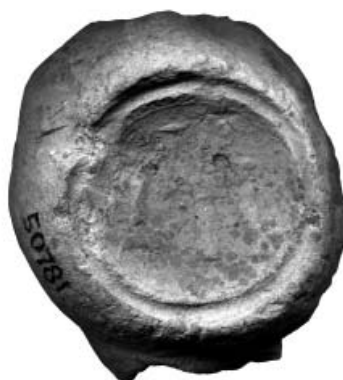
Fig. 10 : BM 84802.