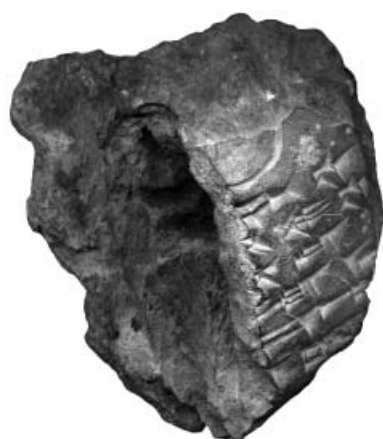
Fig. 21 : 83-1-18, 567.