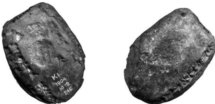
Fig. 13, a-b : K 348.