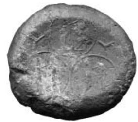
Fig. 25 : BM 84551.