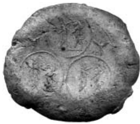
Fig. 23 : BM 84551.