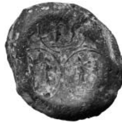
Fig. 27 : BM 84687.