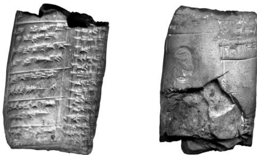
Fig. 1, a-b : K 1995.

This notion is supported by a sealed clay tablet dating to the reign of Sargon II (721-705 BCE) but found at Nineveh (K 1995 = SAA 11 123; fig. 1, a-b ). Its contents give us some idea of what to expect in the case of the now lost lists of “reviewed troops of the king” from Nimrud (§3.1 [A.2.1-2]). The tablet is not preserved in its entirety, but enough survives to describe its format and content matter : it is a vertical tablet with two columns of text on the obverse and reverse, listing horse grooms ( susānu = LÚ.GIŠ.GIGIR) and their superiors. While the columns on the obverse are fully used for entries, the layout of the columns on the reverse is more generous and leaves some space between blocks of text; the empty space in the last column 3 was used to impress a stamp seal, showing a griffin facing left 4 . In the case of this list it is obvious that the seal was not applied to protect its contents but to add additional information. It is a vexing characteristic of the Neo-Assyrian administrative material that headings or other indications of the context of the texts are extremely sparsely used. If we assume that seal impressions allowed identification of the administrative unit responsible for such lists then this would compensate for the lack of references in the texts themselves. Several other examples of sealed lists of personnel are also known from Assur, albeit from private archives 5 .