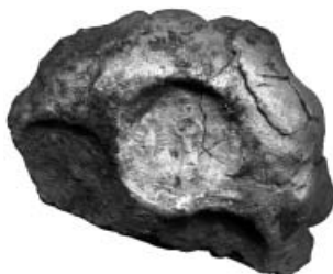
Fig. 16 : ND 808.

[B.1.1] BM 84791 ( fig. 17, a-b ) 38 : no text inscribed on sealing. Sack sealing.