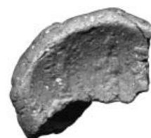
Fig. 11 : BM 50781.

[A.4] Stamp seal showing, inside a guilloche and dot border, the king and queen approaching a goddess, seated on a straight-backed throne supported by a lion, with the scorpion as a filler-motif above the scene. The original seal was recently acquired by the British Museum (2002-05-15, 1; fig. 12, a-b ) 33 . It is a dome-shaped white chalcedony seal with a convex base, a diameter of 1.5 cm and a height of 1.85 cm; it is horizontally perforated and today fixed to a gold wire hoop. The sealing preserved on BM 84671, however, shows that the seal was originally mounted into a setting. The date on SAA 7 94 proves that the seal was used very late in the reign of Sennacherib. This is one of the exceedingly rare instances where the original seal and its antique impression is known to us 34 ; as far as I am currently aware this is so far the only example from the Neo-Assyrian period.