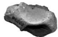
Fig. 30 : BM 89998.