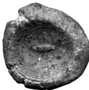
Fig. 7 : BM 84550.