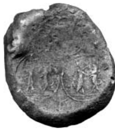
Fig. 24 : BM 84579.