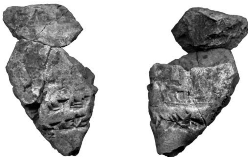
Fig. 2, a-b : ND 6211.