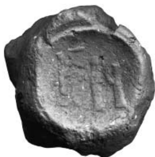
Fig. 9 : BM 84789.