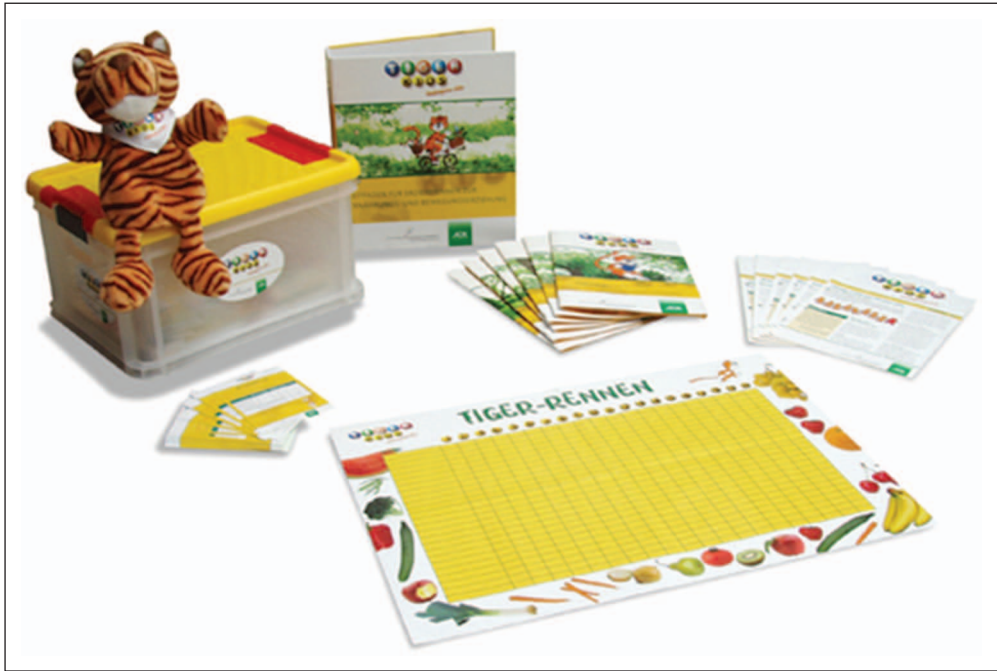
Figure 1. 'TigerKids' material box.