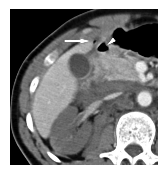
Fig. 2 Transverse contrast-enhanced CT section of the right upper abdominal quadrant of a 28-year-old construction worker who was hit by a pack of wooden boards falling from a height. The patient had a grade IV liver laceration, an injury to the right renal artery causing kidney infarction, and a retroperitoneal hematoma. The small bubble of free air (arrow) adjacent to the duodenum (arrowhead) was missed. The patient had a laparotomy for the injuries to the liver and renal artery, which also showed a rupture of the descending part of the duodenum

imaging protocols and CT scanners used (26, 27). Oral contrast medium is sometimes used to distend the bowel loops but is not necessarily needed to improve the diagnostic performance (28). In the missed findings of this study, oral contrast could have reduced the number of missed lesions. Most of the patients in this study cohort were severely injured with a mean ISS of 26, and oral contrast is not given routinely to such patients in our institution because it is time-consuming. There were also superficial