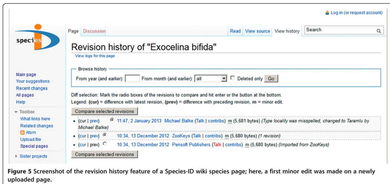
Figure 5 Screenshot of the revision history feature of a Species-ID wiki species page; here, a first minor edit was made on a newly uploaded page.

would surely fit well into the concept of ZooBank. At a time when the idea of open-source is spreading and researchers begin to see dissemination of their works as their obligation and not as a source of income, the biggest problem towards a unitary taxonomy may have disappeared already. If a suitable infrastructure was provided by ZooBank, a critical mass of researchers would start uploading images, diagnosis-texts and sequences to obtain immediate publication and permanent storage on an Official Database of Zoological Nomenclature. The ICZN should team up together with major natural history museums around the world, provide the necessary cyber-infrastructure and make additional relevant changes to the Code. The BOLD system [link to www.boldsystems.org ] [40] could serve as a source of inspiration, because data upload is easy, and each individual can have its own voucher page with images that show what the voucher looks like, maps where it comes from, collecting data, sequences, trace files and most importantly information where the voucher physically IS (e.g. Voucher of Batrachedra praeangusta link to http://www.boldsystems.org/index.php/Public_RecordView?processid=LBCH3416-10 ).