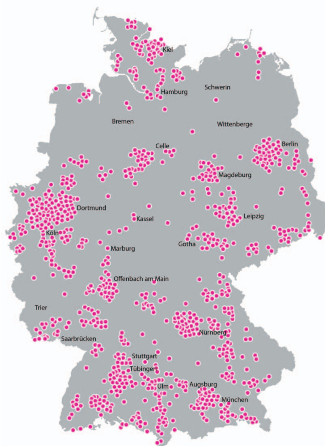
Fig. 2. Distribution of PACT study centers (n = 109) throughout Germany.

During the study, the patients were permitted to receive any further investigations and treatments deemed necessary by their investigators according to current standards of care. As this was an in-practice evaluation study, the decision to treat with anastrozole was required to be taken, and documented, independently (tumor board or treating physician) prior to