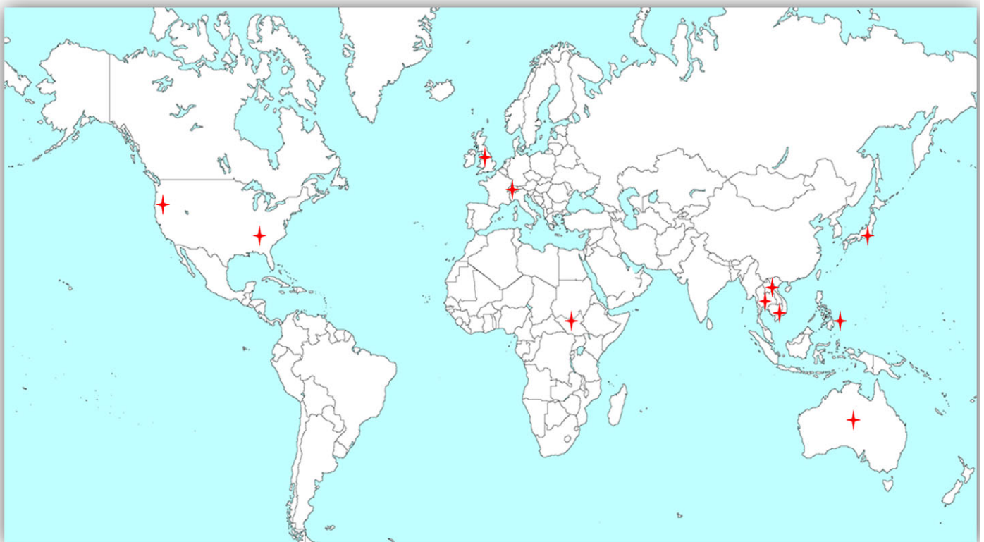
Figure 1. Geographic diversity and distribution of respondents in the study (red marks represent respondents' locations).

Most respondents described concerns about malaria elimination through MDA. They raised four types of issues related to