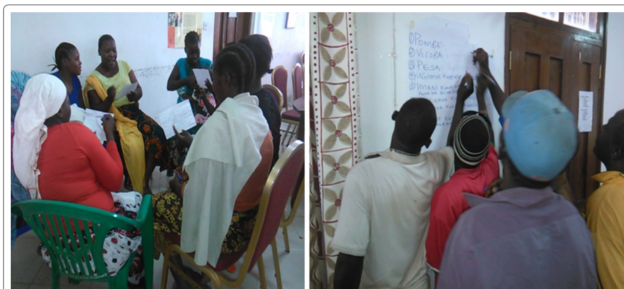
Fig. 2 A picture showing participants conducting member check for qualitative data validation

Table 3 presents the results of the multinomial logistic regression analysis. The majority of the independent predictors of the proxy lifetime extramarital affairs were consistent with those in recent (12 months prior to survey) extramarital affairs. The relative risk ratio (RRR) of having extramarital affairs versus non-extramarital affairs in the proxy-lifetime significantly decreased as age increased (RRR: 0.98 95% CI 0.98–0.99), was higher among men (RRR: 1.27; 95% CI 1.06–1.52), among members of a Village Community Bank (VICOBA) (RRR: 1.35; 95% CI 1.08–1.69), among consumers of alcohol (RRR: 1.54; 95% CI 1.29–1.82), among those who re-married (RRR: 2.50; 95% CI 2.07–3.02) and were lower among those of catholic religion (RRR: 0.82; 95% CI 0.71–0.95),