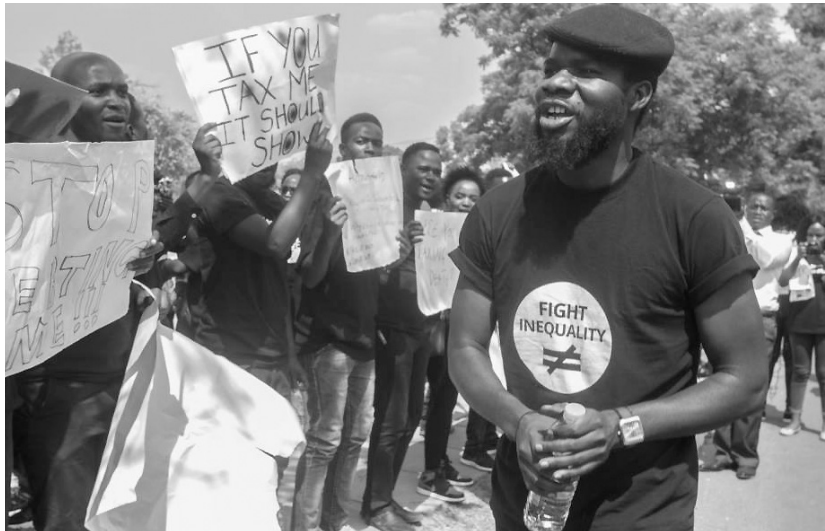
Demonstration during the budget speech of the Minister of Finance. Lusaka 28 September 2018.