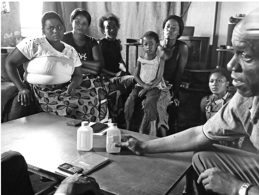
A sample of “drinking water” in Kankoyo, Mufulira, presented during a site-visit of the Swiss ADR Campaign.

“Those who can, move away from here,” said our partners from the town of Mufulira in the Zambian Copperbelt. The Mopani copper mine has been majority-owned by Glencore since the Zambian mines were privatized at the beginning of the 2000s. Many hoped for an improvement in living conditions, but this did not happen. The house façades peel off due to the acid rain, the air causes breathing problems, and many jobs in the mine have disappeared. And then there is the “drinking water”: with visible residue, which nobody drinks before having first boiled it. Since they cannot move away, the residents of the neighbourhoods Butondo, Kankoyo and Kantanshi around the mine Mopani want access to clean water.