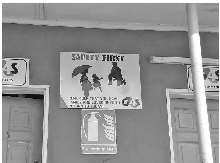
Mining companies externalize security issues to its labour force. First Quantum Minerals, Solwezi, Zambia.

Besides debt, many miners in Zambia agree that with a government and union that is unable to regulate the labour market, subcontracting is the future of work in Zambia's mining sector. This is because the new mining companies run a profit driven production system with retrenchment of workers as the first response to commodity price volatility, and subcontracting is their main way of reducing production costs. As one miner lamented: "When we will lose our jobs, if we are lucky we will get a job as a contractor. I think that going forward all jobs in the mine will be sub-contracted. These days, when I go home from work, my wife and even children ask me if I still have a job. Losing a job is so common that people are almost always expect it."