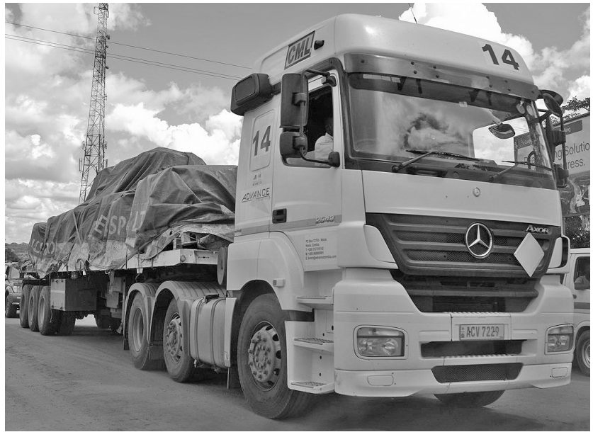
Swiss companies are not only major players in the copper trade but also make profits in its transport.

The examples described here do not, by any means, cover all areas in which Swiss companies are important