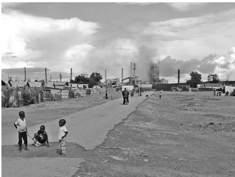
The neighbourhood of the Mopani mine in Mufulira (Zambia). The meaning of the mining sector as an employer has radically changed (picture: www.dirtyprofits.de 2017).

The privatization of the national mining company Zambia Consolidated Copper Mines (ZCCM) that ended in 2000 sought to achieve two financial goals. The first was to stem the operating losses borne by the public budget that were crowding out already low public expenditure. The second was to reverse a 30-year trend of underinvestment in exploration and production, which, in large measure, was responsible for the losses. Certainly, capital inflows to the sector have been substantial since privatization and have exceeded the commitments originally anticipated. Between 2000 and 2015, a total of US$ 13.1 billion was invested in the sector. This investment has facilitated the reopening of previously closed mines, exploration and opening up of new mines in North Western province, and investment in machinery, equipment and technology.