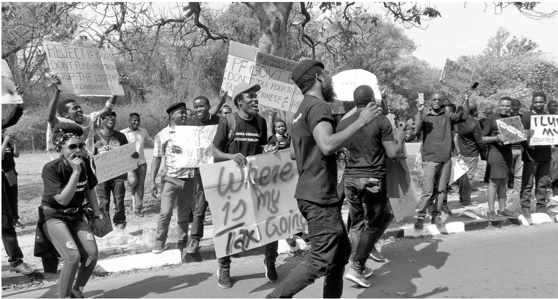
Demonstration during the budget speech of the Minister of Finance. Lusaka 28 September 2018 (picture made available by the author).

airports. The cost of living has risen dramatically and the population is suffering as a result. Drastic cuts in spending on health, education and other public services increase social inequality, already very high in Zambia (ranking fourth in the worldwide index for inequality). Students have already protested, and other social protests could follow.