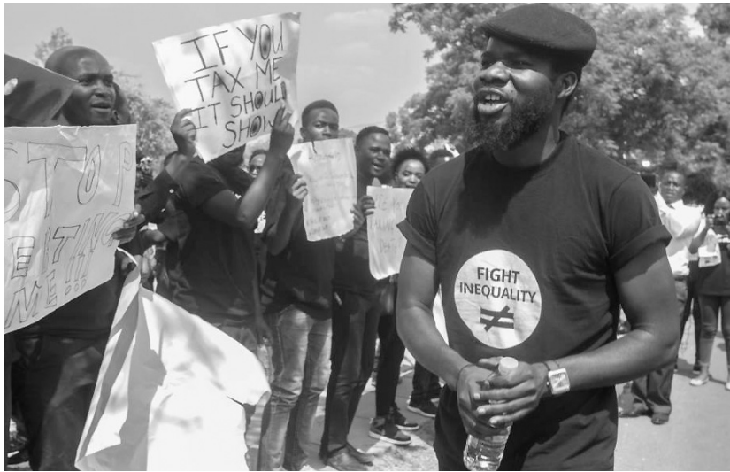
Demonstration during the budget speech of the Minister of Finance. Lusaka 28 September 2018.