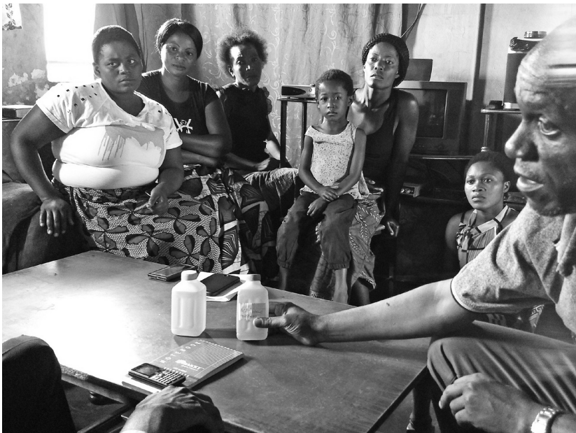
A sample of “drinking water” in Kankoyo, Mufulira, presented during a site-visit of the Swiss ADR Campaign.

“Those who can, move away from here,” said our partners from the town of Mufulira in the Zambian Copperbelt. The Mopani copper mine has been majority-owned by Glencore since the Zambian mines were privatized at the beginning of the 2000s. Many hoped for an improvement in living conditions, but this did not happen. The house façades peel off due to the acid rain, the air causes breathing problems, and many jobs in the mine have disappeared. And then there is the “drinking water”: with visible residue, which nobody drinks before having first boiled it. Since they cannot move away, the residents of the neighbourhoods Butondo, Kankoyo and Kantanshi around the mine Mopani want access to clean water.