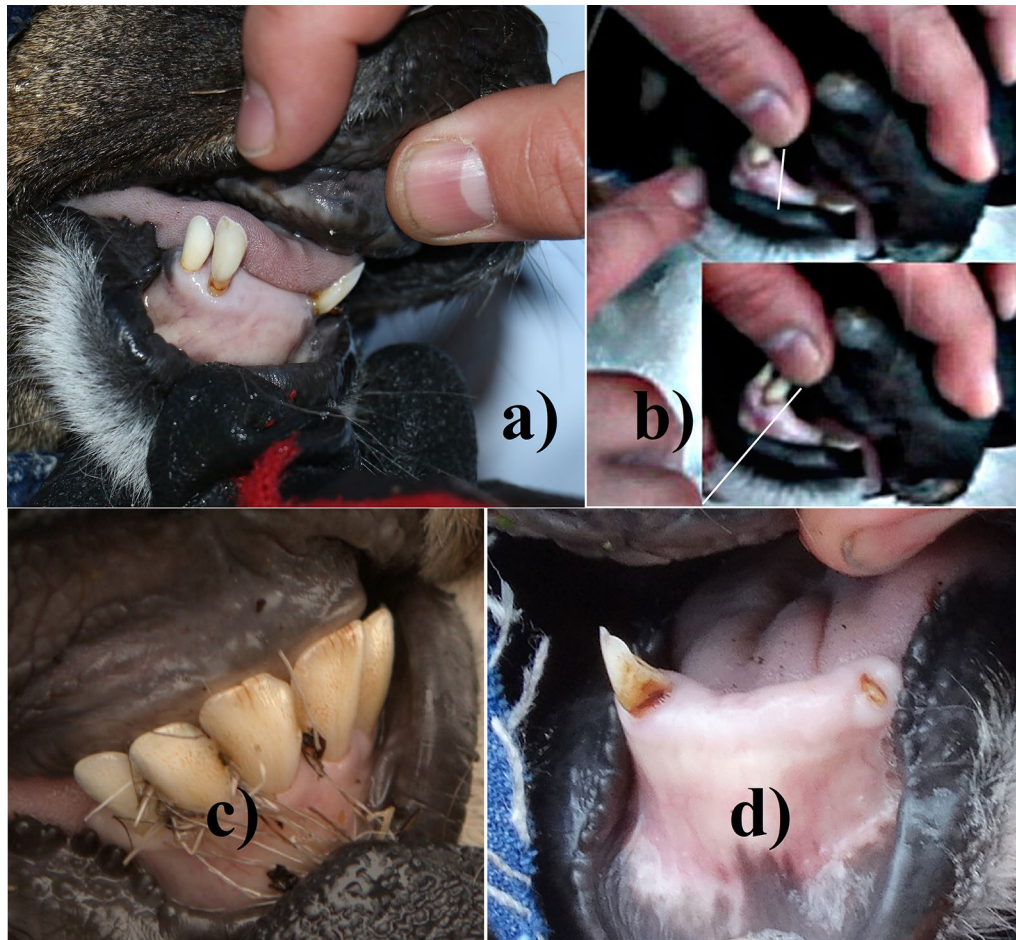
Fig. 2 a Case 3, female 3.5 years old: loss of 4 central incisors with gums healed over, receded gum and exposed roots of remaining teeth; b remaining teeth where completely loose with tips moving about 10 mm; c Case 4, female 1.5 years old: damaged front teeth showing pitting and brown staining, incisors with several vertical fissures 2–3 mm in length, and absent canines; d Case 5, male 4–5 years old: only 1 front tooth remains; the right canine is broken and only part of the root of the left canine remains at gum level

Given the fresh dead huemul had not only lost incisors, but also exhibited severe mandibular and maxillary lesions, the other diseased but live individuals most certainly have similar additional lesions. These exfoliated front teeth resemble periodontitis (“broken-mouth”) described in sheep [11], except that symptoms in huemul also include lesions of premolars and molars, and affected young individuals. Observations of additional huemul at close distances revealed asymmetrical velvet growth and lumps beneath mandibles: therefore, likely other cases affected by clinical disease. Reduced foraging efficiency via exfoliated incisive teeth presents the most parsimonious explanation for observed impacts on body condition, low average age of 3.1 years [2], and recruitment rates too low to allow re-colonization of habitats used historically.