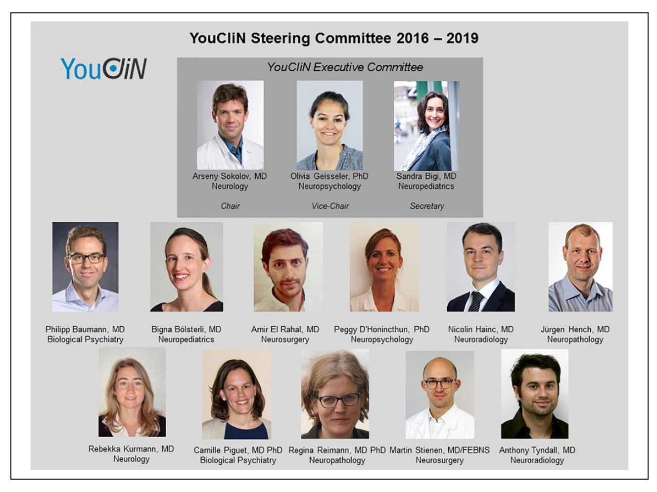
Figure 1. The YouCliN Steering Committee is composed of two junior representatives of each clinical neuroscience discipline and is coordinated by an elected Executive Committee composed by a Chair, Vice-Chair and Secretary. YouCliN: Young Clinical Neuroscientists.

In addition, the three largest neuro-specialties (neurology, neuroradiology and neurosurgery) have discussed the implementation of interdisciplinary training: a 'common trunk'. This will allow residents to rotate more easily between the different fields of clinical neuroscience in order to widen the professional horizon and find out which speciality suits them best. This enriching concept is already established on a local basis in some of the larger Swiss hospitals. The YouCliN collaborates with the seniors from the SFCNS concerning a 'common trunk' on a national level, with the intention to provide an input from the trainees.