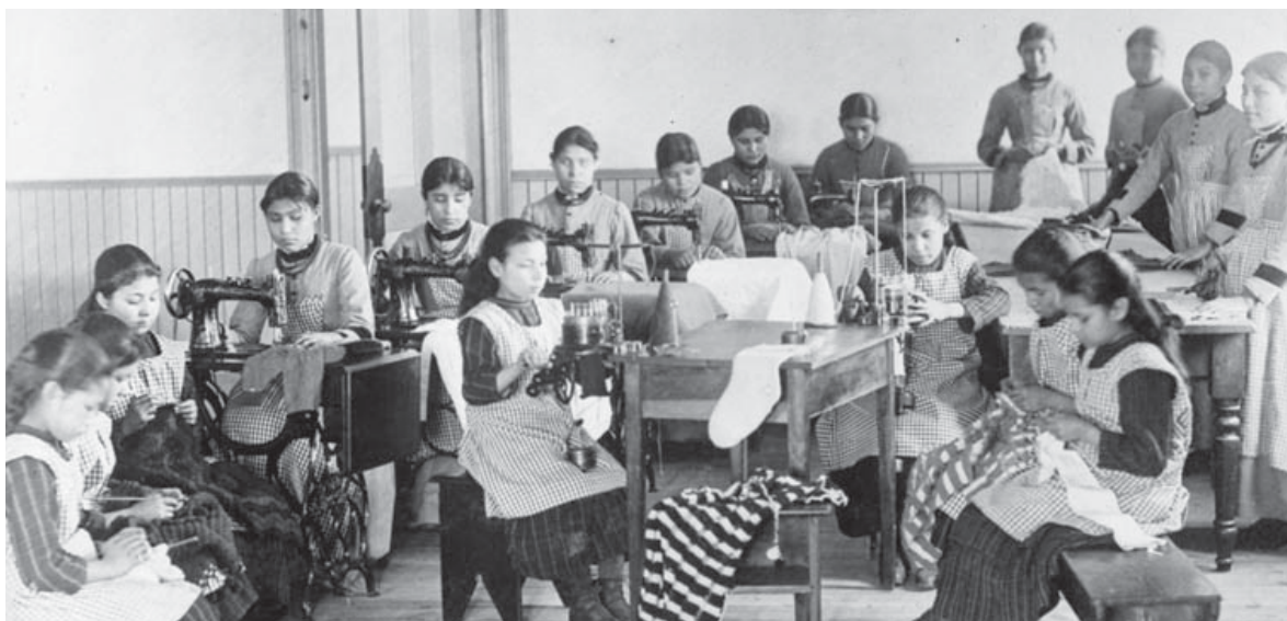
Sewing class at Fort Resolution Indian Residential School, N.W.T. (undated image,).