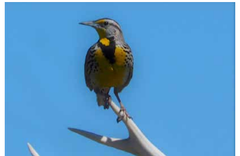
A meadowlark perches on a set of deer antlers tied to a grave.