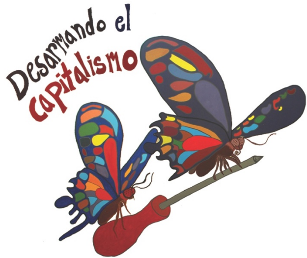
Figure 2: El Cambalache's Logo, Desarmando el Capitalismo, which in English is Dismantling Capitalism. Drawing by Erin Araujo, painted collectively on the walls of El Cambalache.

In El Cambalache we develop and practice a performative approach to understanding the economy. As we develop the micro-economy of El Cambalache it is understood that the project embraces one of myriad ways of interacting economically. Rather than create El Cambalache within a revolutionary mindset, offering to participants a solution to economic and