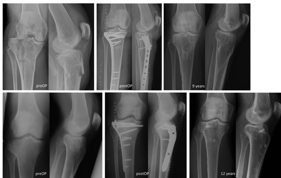
Fig. 1 Radiographs showing preoperative, postoperative, and long-term condition after tibial head fracture. Patient 1 nine years after bicondylar tibial head dislocation fracture. Patient 2 sustained a lateral depression type tibial head fracture 12 years ago

In this prospective study, we demonstrate that the FJS is a valid and reliable PROM-tool in patients after surgical