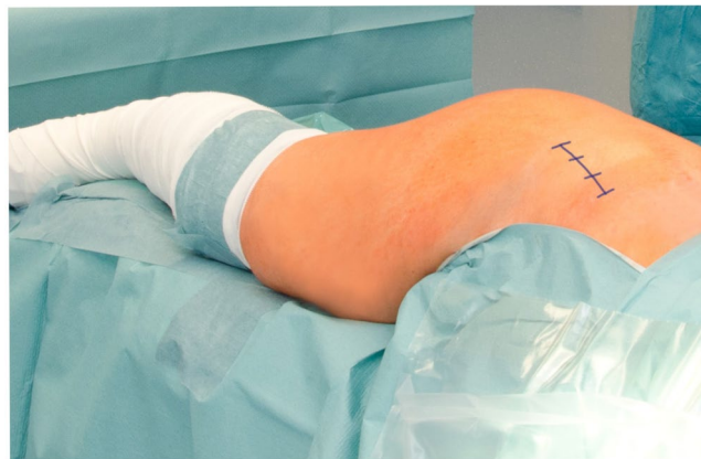
Figure 1. Patient position and skin incision of minimally invasive THA through an anterolateral approach in the lateral decubitus position.