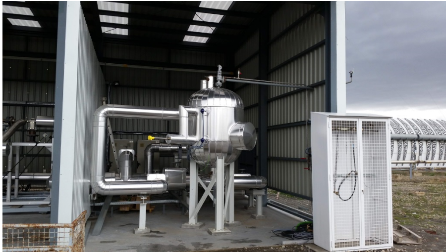
FIGURE 3. BOP and nitrogen stand of the REPA test loop at PSA.

The BOP is composed of a variable speed HTF pump which circulates the thermal oil through an electrical heating system before passing through the elements to be tested, placed in the test bench. The system is connected to an expansion vessel able to compensate the HTF volume difference caused by its big density variation with thermal changes, figure 3. It is foreseen in a following phase to add an oil cooler to the suction of the pump and increase the heating power. The elements forming part of the BOP are: