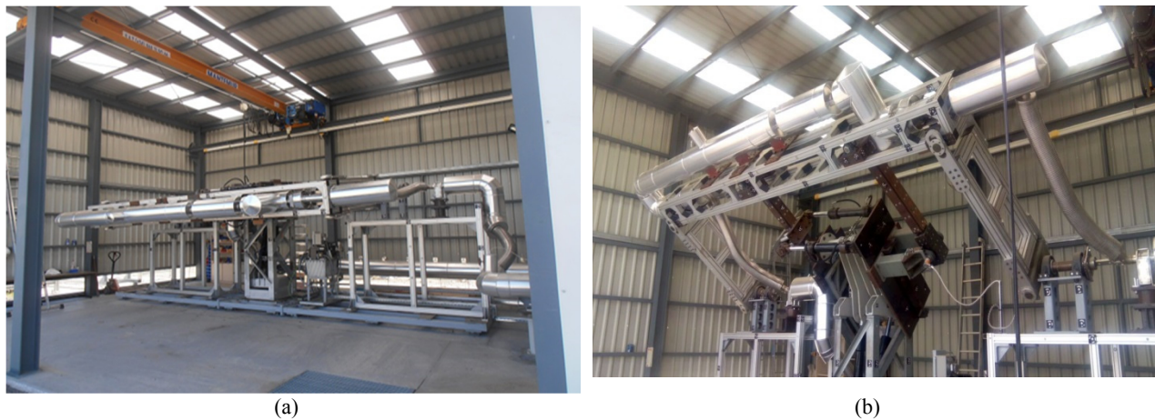
FIGURE 4. Kinematic unit rotation test into stow position (a) and at 45° position (b)

The initial preoperational tests started making the necessary fittings in the rotation and translation elements to assure a representative kinematics unit behavior, exactly alike the PTC rotation and absorber tube expansion where it is meant to function. Figures 4 and 5 depict the kinematic unit in several positions.