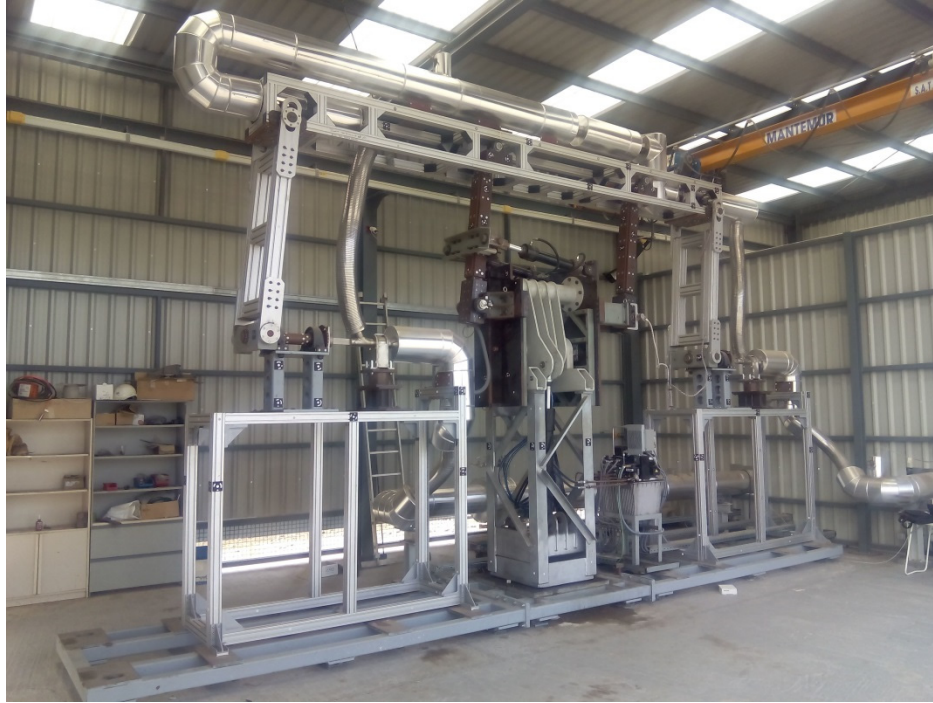
FIGURE 5. Kinematic unit rotation test in vertical position and translation pistons contracted

Test should be performed at different temperature levels, from ambient to the maximum allowed temperature by both, HTF and component to be tested.