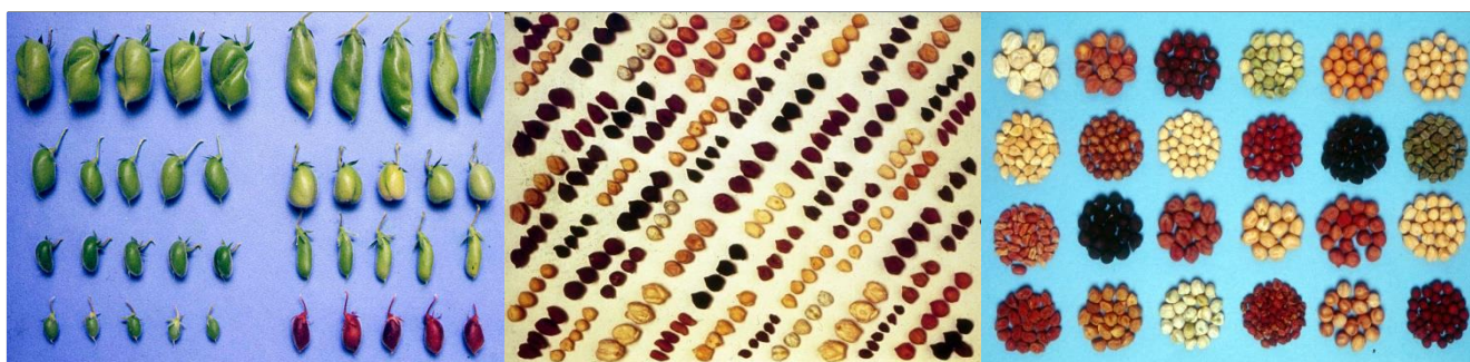
Figure 1a. Diversity for pod (left) and seed (center and right) traits in chickpea