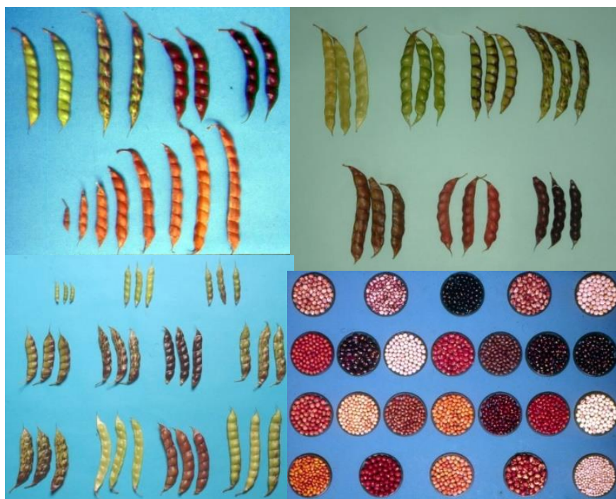
Figure 1b. Diversity for pod (top and bottom-left) and seed (bottom-right) traits in pigeonpea