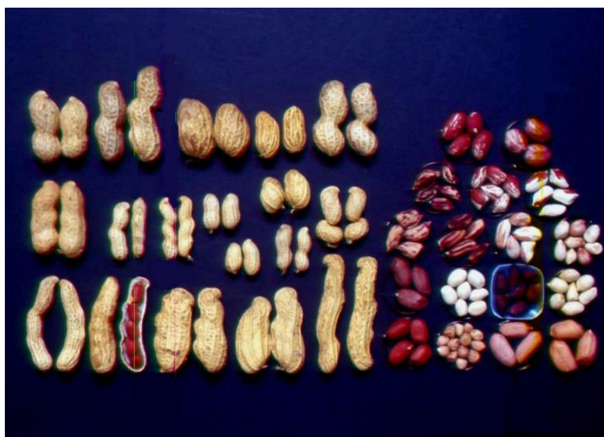
Figure 1c. Diversity for pod (left) and seed (right) traits in groundnut (or peanut)