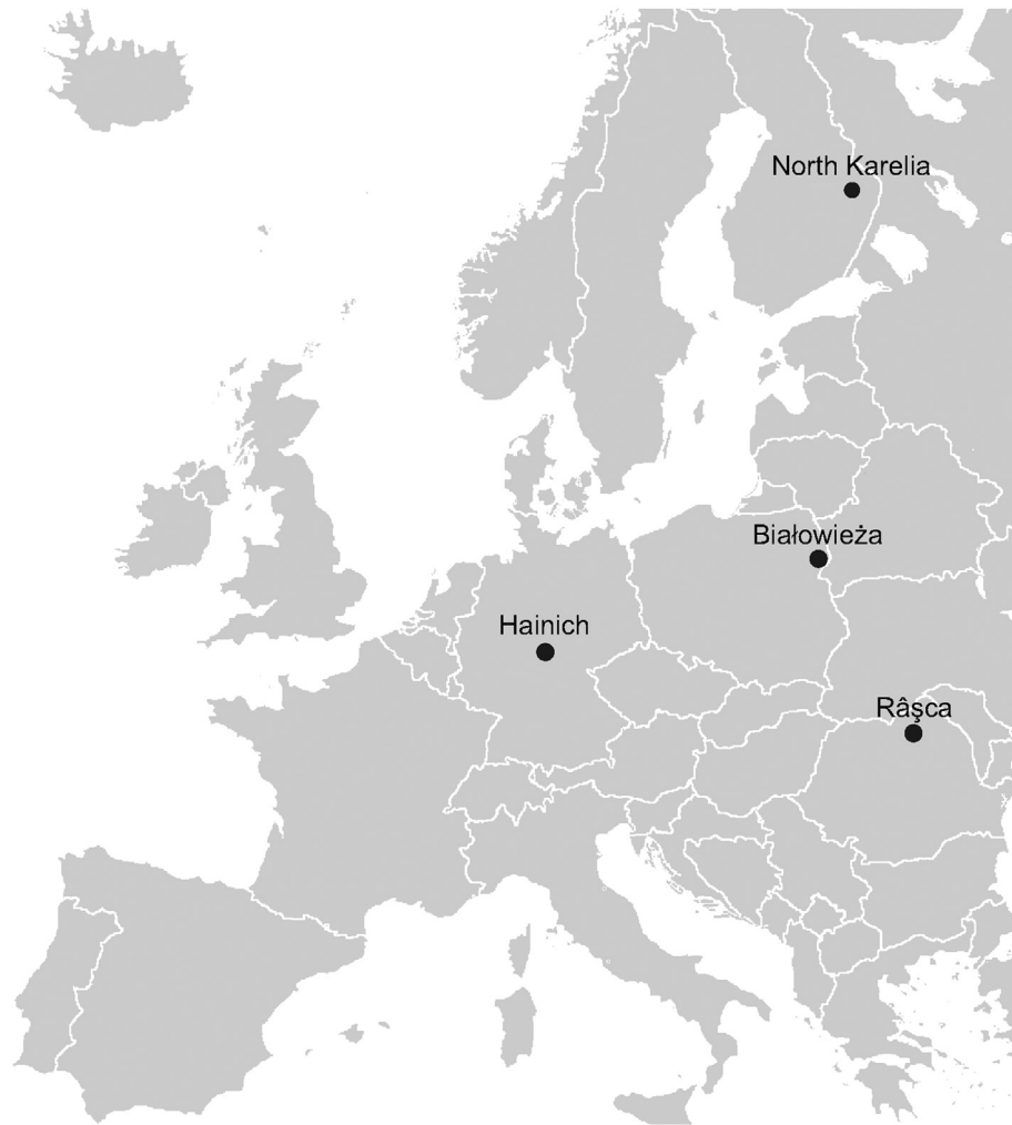
Fig. 1. Map of European sampling sites in different forests utilized to study the foliar fungal community of current-year Norway spruce needles.