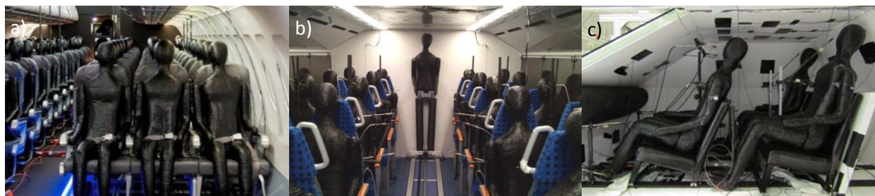
Figure 1: Thermal manikins. a) during flight tests with an A320 b) in a generic train laboratory c) in a generic car mock-up.

The core of the TM consists of flame-retardant foam, equipped with heating wire and a thin layer of black heat-conductive aluminum. By varying the spatial density of the wrapped wire in the head region, a higher heat flux density is realized. Each TM, with a volume of 50 l and a surface of 1.52m 2 , can be heated by an external power supply to provide a constant sensible heat release in a range of 0 to about 150 W. Since we need the manikins in large quantities to equip whole aircraft or train compartments, a low-cost system with simple handling and commissioning characteristics is important. The application of our TMs in test facilities within an Airbus A320 [1], in a train laboratory [2] and a generic car [3] is depicted in Figure 1.