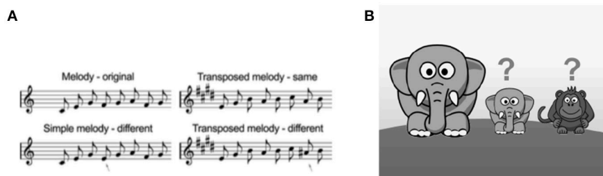
FIGURE 2 | (A) Examples of stimuli from the c-MDT Simple Melody condition (L) and transposed melody condition (R). Children listen to two melodies and decide whether the second was the same or different. Arrows represent the “different” note. Melodies range from 5–11 notes; examples are depicted with 8 notes. Figure adapted from Karpati et al. (2016). (B) Graphical display of response probe for the c-MDT. Image is presented in full color within the actual task. Small animals represent “same” and “different” response choices.

There are two rhythms per difficulty level, for a total of six rhythms which are presented in counterbalanced order. Rhythms were matched for number of notes; each rhythm consists of 11 woodblock notes spanning an interval of 4–5.75 s, including rests. As with the adult task, a single trial of the c-RST consists of two phases: (1) “Listen” and (2) “Tap in Synchrony.” In the graphical display, a giraffe with headphones is displayed on the computer screen. During the Listen phase, the giraffe’s headphones are highlighted, indicating that the child should listen to the rhythm without tapping. During the Tap in Synchrony phase, the giraffe’s hoof is highlighted, indicating that the child should tap along in synchrony with each note of the rhythm using the index finger of the right hand on a computer mouse. Each of the six rhythms is presented for three trials in a row, for a total of 18 trials. Before starting the test, children complete five practice trials at the Strongly Metric level, with feedback from the experimenter. The rhythms used for the practice trials are not those used in the main task. Performance on the RST is measured in two outcomes: (1) percent correct, or the child’s ability to tap within the “scoring window” (as explained below); and (2) percent inter-tap interval