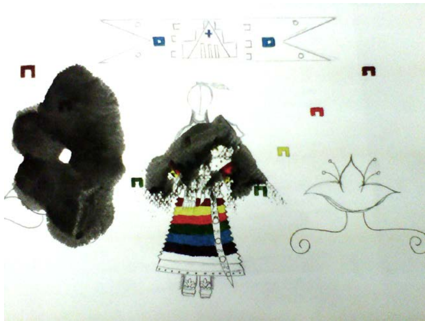
Figure 2. Traditional dancer.

I remember having that dream of that [geometric] design that was at the top of the paper so I wanted to include it in there ... I wanted this [picture] to kind of represent myself because my Indian name is "[ ___ ] Woman." So my animal, my grandpa said it was the horse, and if I was ever to bead something or make something for myself to always include something with a horse in it. And the flowers just ... represent the earth.