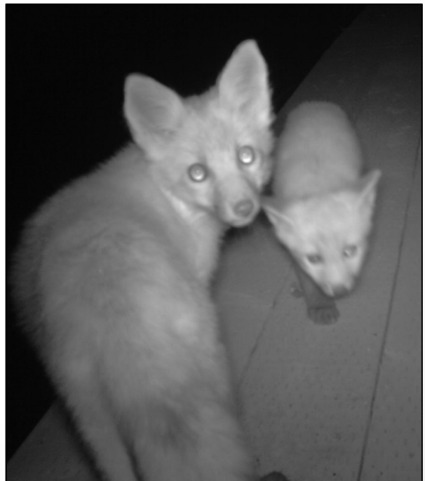
Figure 9: Red fox and kit ( Vulpes vulpes ).