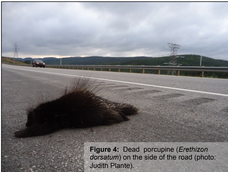
Figure 4: Dead porcupine ( Erethizon dorsatum ) on the side of the road.

To characterize the road-kill locations of the mammals mortalities along the road, we will examine landscape features such as distance to water bodies, forest cover, and different forest types. We will also include in our analysis some road features such as road sinuosity and road profile.