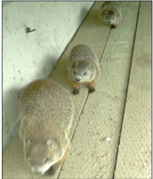
Figure 8: Groundhog and kits ( Marmota monax ).

Passages that are best suited to the largest number of species are expected to be used most often and by the widest variety of species.