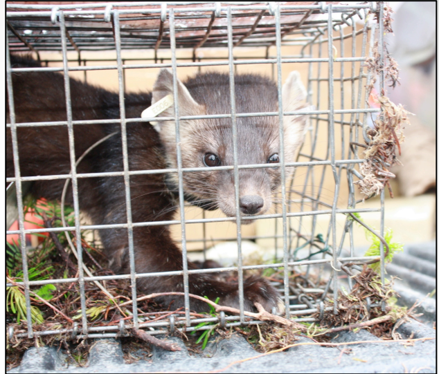
Figure 10: Recaptured marten ( Martes americana ) inside a trap. Its collar and ear tags are visible.

So far, we have found that martens along the 4-lane mitigated highway (HWY 175) are less likely to cross the road when compared to martens along the 2-lane highway (HWY 381, control site). The majority of martens on HWY 175 limit their movements right at the edge of the forest next to the highway, never venturing across the 4-lane highway. Our results suggests that the widened and mitigated highway still represents a more significant barrier for martens than a 2-lane unmitigated highway and that it might limit the gene flow between the sub-populations on the two sides of the 4-lane highway.