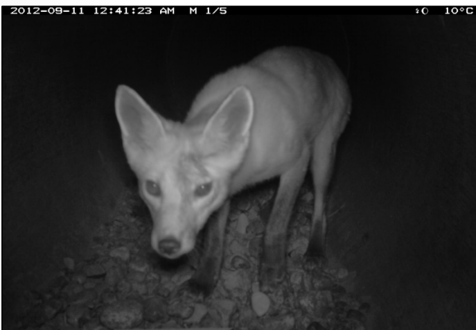
Figure 1: Red fox ( Vulpes vulpes ) crossing a wildlife passage.

In order to reduce these impacts, fences for large and medium-sized mammals as well as wildlife passageways for large, medium-sized, and small mammals were put in place along HWY 175. These fences prevent animals from crossing the road at grade and direct them to the wildlife passages where they can cross safely under the highway. These measures re-establish habitat connectivity between the two sides of the highway if the animals find enough wildlife passages along the highway. The passageways along HWY 175 are among the first that have been built in Quebec, which provides a good opportunity to study their effects on the surrounding wildlife populations.