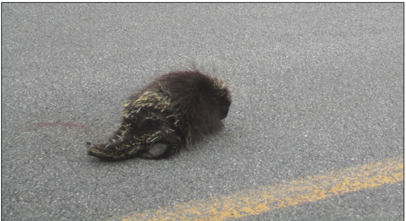
Figure 7: American porcupine ( Erethizon dorsatum ) on the side of the road.

Furthermore, as all of the species detected in this road mortality study are common species, it may be tempting to assume that road mortality does not constitute a threat to their population size and persistence. However, the effects of additive road mortality on populations of seemingly common species can be quite substantial. The effects of road mortality may accumulate over time, and in combination with increased habitat fragmentation, the negative implications of road mortality on population viability greatly increase.