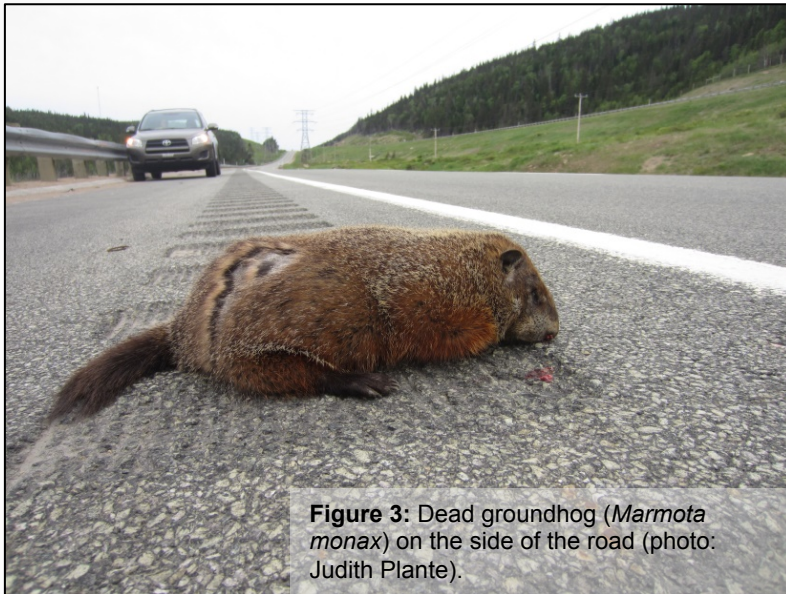
Figure 3: Dead groundhog ( Marmota monax ) on the side of the road.

During three years of field work (2012-2014), 733 mammals were found dead along Highway 175. The North American porcupine was the most represented species with 287 mortalities. Micromammals such as voles, shrews, and mice were second with 192 mortalities. Micromammal mortalities were highest in 2012 and greatly decreased in 2013 and 2014. This can be explained by the 4-year population cycles observed in boreal forests for that group of species. The details for the three years are presented in figure 5.