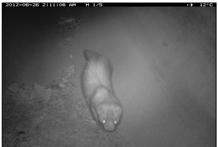
Figure 2: Mink ( Neovision vison ) crossing a wildlife passage.