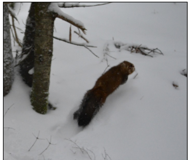
Figure 11: Recently released marten ( Martes americana ) in early November 2014.

However, it is possible that with time, animals along the highway get habituated to the widened road and the mitigation measures, but in order to know whether or not this is the case, a more long-term monitoring of the affected populations would be necessary.