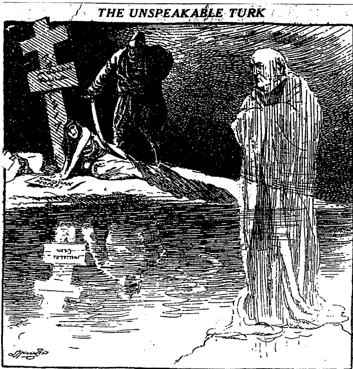
SHADE OF GLADSTONE—HE HAS NOT CHANGED.