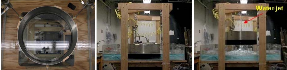
Fig. 1. Experimental setup; Left) Top view of the water table with the circular aluminum gate of radius R_o = 26 cm initially at a closed position; Middle) Side view of the water table (Dimension: 90 cm x 105 cm x 20 cm) with the gate initially at a closed position separated two volumes of water; Right) The formation of the central water jet after the extraction of the gate activated by the three pneumatic pistons.