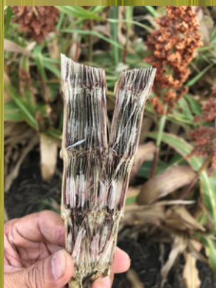
Figure 7 Mixed stalk rot infection of charcoal and Fusarium stalk rots in sorghum