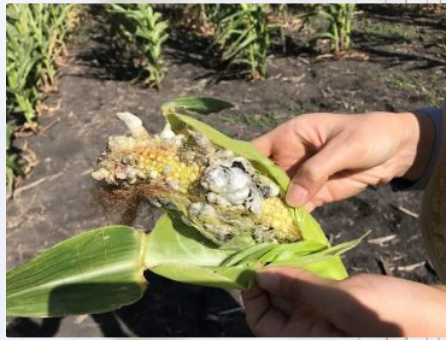
Figure 1 Boil smut in maize cob.

The most significant damage in maize crops observed was caused by hail last November 2017, near Norwin and Bongeem in southern Qld, followed by insect damage in some maize paddocks.