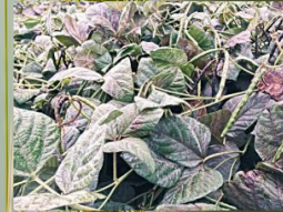
Figure 5. Powdery mildew on mungbean