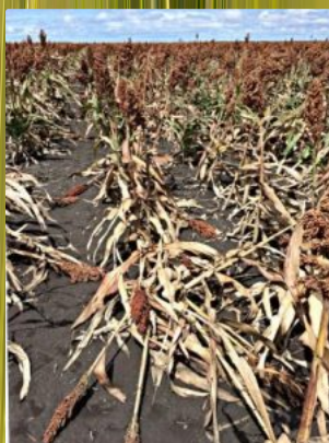
Figure 8 Sorghum lodging in central Queensland