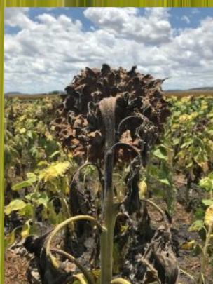
Figure 10 Rhizopus head rot on sunflower