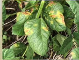
Figure 4 Tan spot signs on mungbean