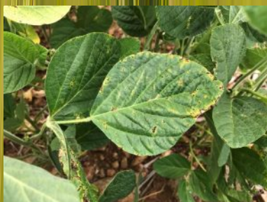
Figure 9 Bacterial blight on soybean

There was very little soybean planted this season, with bacterial disease found in only a few paddocks. A soybean crop in southern Qld was found to have 20% incidence of bacterial blight. A paddock, located in Long Plain northern NSW, had >50% incidence of the disease.