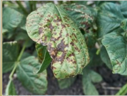
Figure 3 Halo blight disease signs on mungbean.