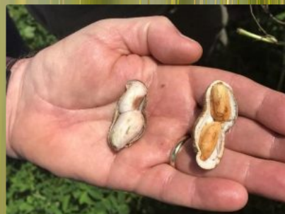
Figure 6 Healthy peanut (left), peanut kernel shrivel syndrome affected peanut (right)