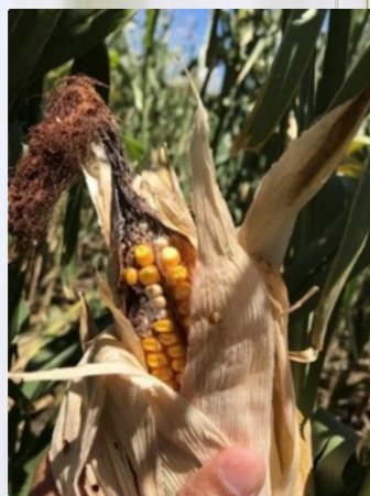
Figure 2 Cob tip rot in maize