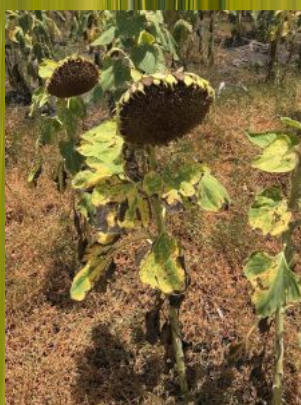
Figure 11 Verticillium wilt of sunflower