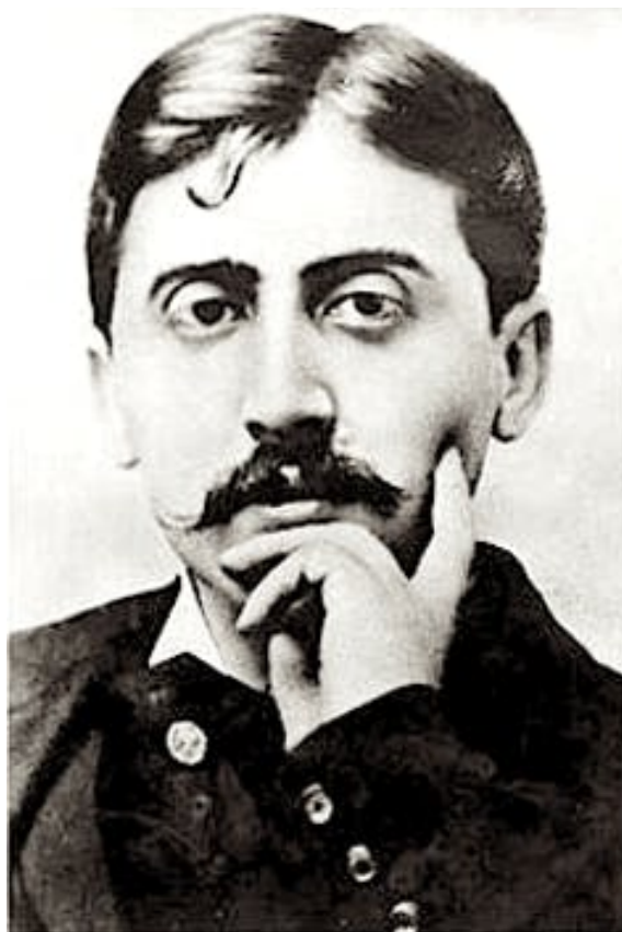
Marcel Proust in 1900.

Sometimes it is about releasing writing deemed by corporate publishing houses as inappropriate for their imprints, often because it is of a genre classified as “non-commercial” (such as the short story or novella). It is just as often about releasing work on platforms the big publishing houses have not yet embraced (such as mobile devices) or taking control of the process and making it more personal, less corporate.