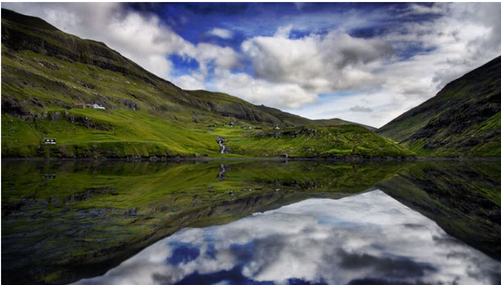
David Malouf's Imaginary Life plays out in the hillsides of the Black Sea. What's so Australian about that?

Adjunct Fellow, Southern Cross University