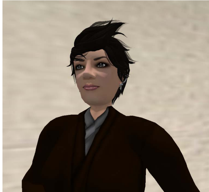
Figure 1: The author as Helen Frak dressed as a Jedi.

conversation, either through text or voice chat, with participants, there was no discussion about the religious or role-play aspects of Jediism as “out of character” (OOC) chat was usually prohibited during role-play. Though it would be possible to converse with these people outside of role-play, this remains an objective for future research.