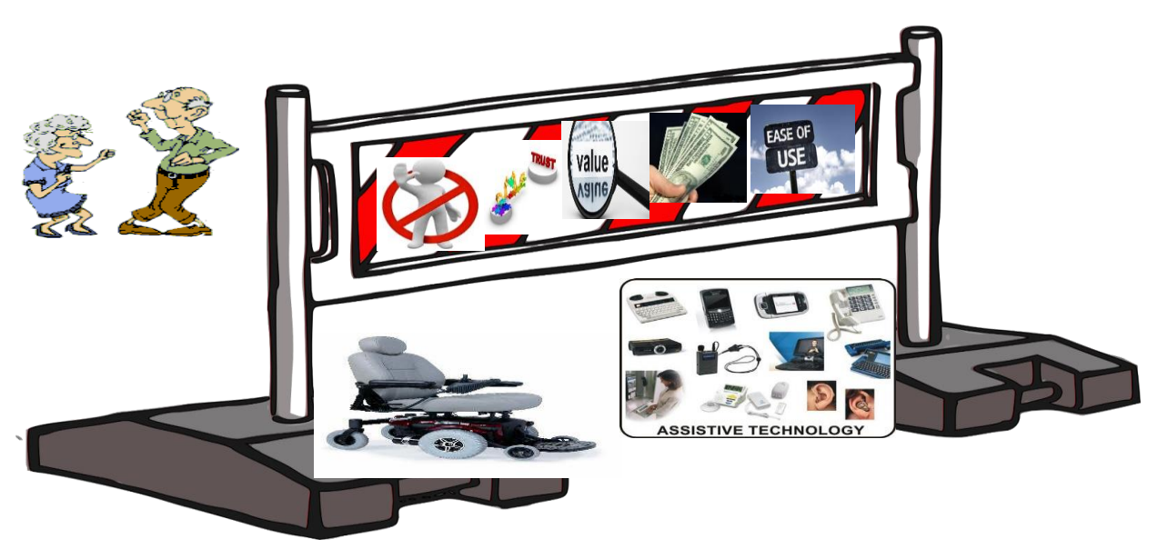
Figure 1: Graphical Abstract