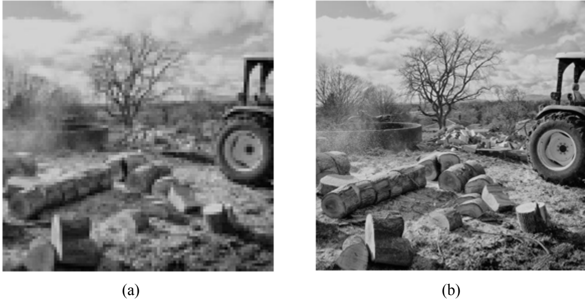
Figure 3 – A sequence of 40 compressed low-resolution images (one example shown on the left) was used to reconstruct the higher resolution image shown in (b).