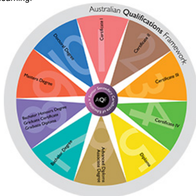
Diagram One: The Australian Qualifications Framework Wheel

No longer is it expected that a person's original training or qualification will be the primary basis of what they do at work over their working life. This is the context within which the AQF has been developed. The primary intent of the AQF is usually illustrated as a wheel with equal segments given to each of the ten levels from leaving high school [Level 1] to the highest academic award [Level 10] (AQF Council 2013). The thrust of the AQF is directed towards supporting a learner's journey, through time, around the wheel (See Diagram One below). All segments are depicted as being equal in size and joined to the next one. Such illustrations convey the impression of a simple, consistent stepwise progression from the lowest level to the highest level of learning.