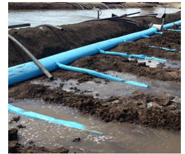
FIGURE 2. Automated system in operation.

The automated furrow irrigation system (Figure 2) was evaluated over the 2013/14 cotton season and was found to work reliably without manual intervention. The preliminary results indicate that higher irrigation application efficiency (up to 90%) is achievable along with significant labour saving.