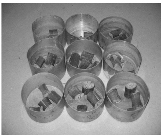
Fig. 2. Cut section of internode samples which have been oven dried.

where W_I is weight of the wet internode with metal container and D_I is weight of the dried internode with metal container.