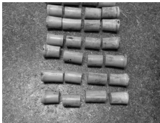
Fig. 1. Photo of cut internodes and the schematic of the four sections scanned (Nawi et al., 2013c).