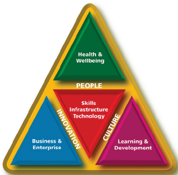
A Systems Approach for Research on Resilient Regions

As a key part of USQ's strategic research development, the Institute for Resilient Regions (IRR) is leading and delivering applied social sciences and humanities research into innovation for building regional resilience and thriving communities in non-metropolitan Australia.